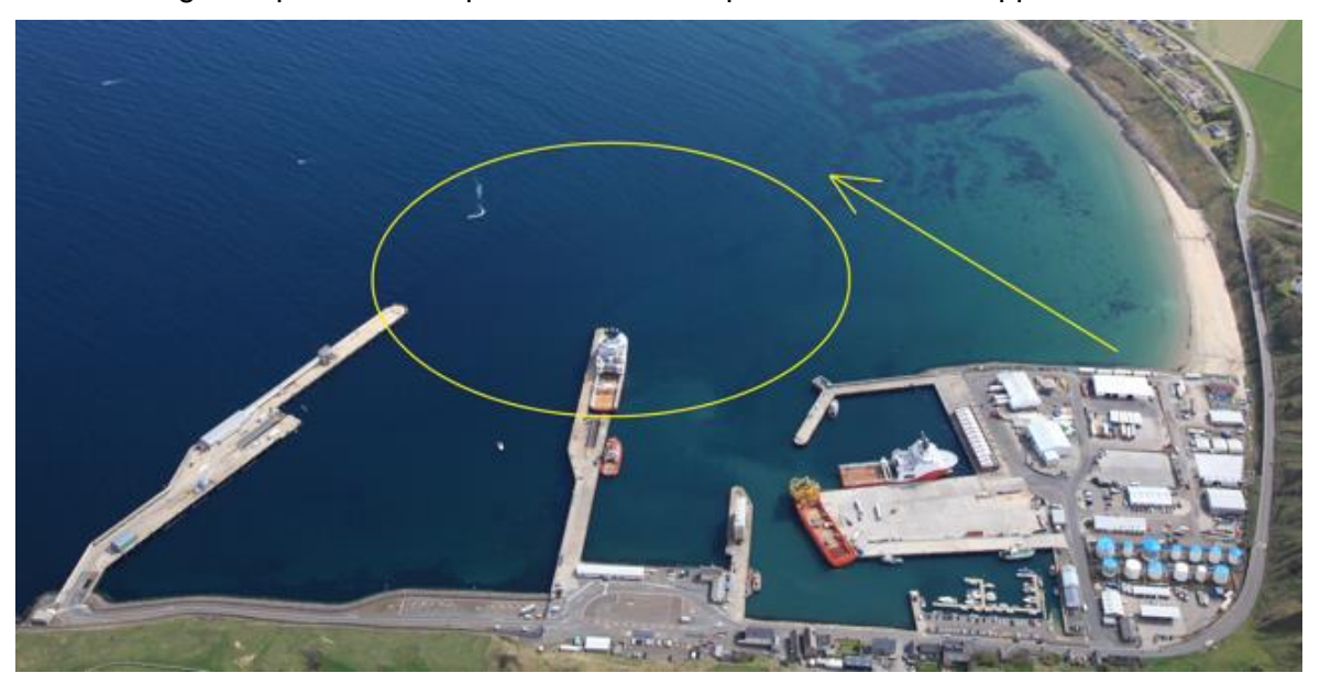
Figure 2: Main harbour approach area & preferred route for kayaks

No coaching or capsize/rescue practice is to take place in the main approach area.