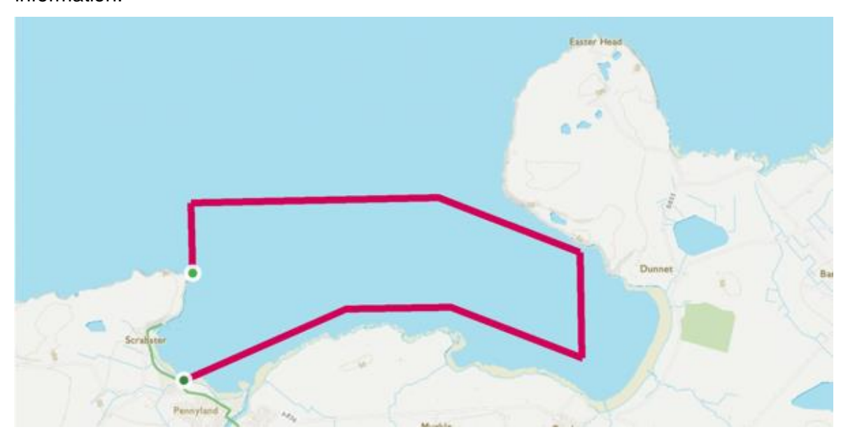
Figure 3: Scrabster Harbour Limit